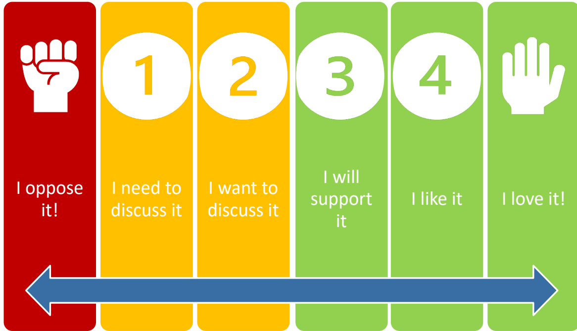
Fist to five: Fletcher, A. (2002). FireStarter youth power curriculum: Participant guidebook . Freechild Project.